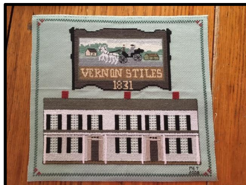
Counted Cross Stitch designed and stitched by Mary Ellen Tomeo